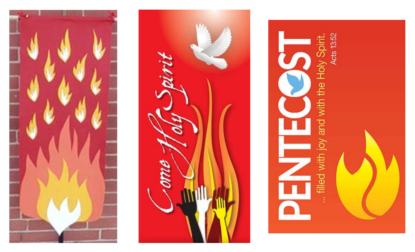
KIPandfriends. Learning at Home A4 (a) Pentecost 2020

Here are some Pentecost banners. These contain symbols we use to remember and think of the Holy Spirit.